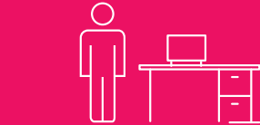
Service Delivery Manager